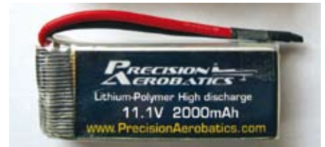
The power source is the 3000mAh three cell Lipo pack.

I am very pleased with each component of the power system, especially the gearbox for its strength, and looks. The adjustable gear lash was a great feature as spur gears will last a long time with the ability to fine tune the gear mesh. The motor, running close to its maximum power out put, powered the 680-770g Katana Mini with ease. I find it outstanding performance for a motor