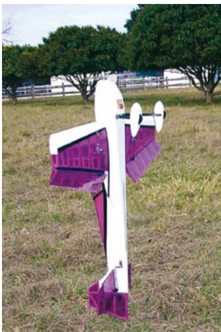
The system offers excellent performance in the Katana Mini.

The PA 25A ESC has a continuous rating of 25A as the name suggests and is fully stick programmable. That’s a good 270w available watts from the ESC. Once